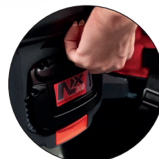
Easy battery change