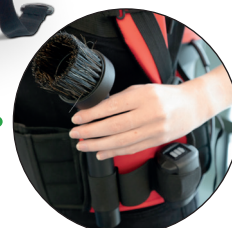
Waistbelt tool storage