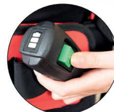
Integrated hand control